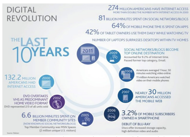
FIGURE 3-1 New ways to connect and communicate, adapted from Nielsen data. SOURCE: Michelle Levander's presentation, September 22, 2014.