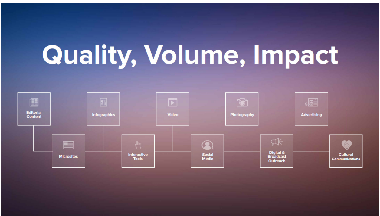
FIGURE 4-1 Quality, volume, impact.

To show how digital and social media can be used effectively, Roig reviewed several successful projects.