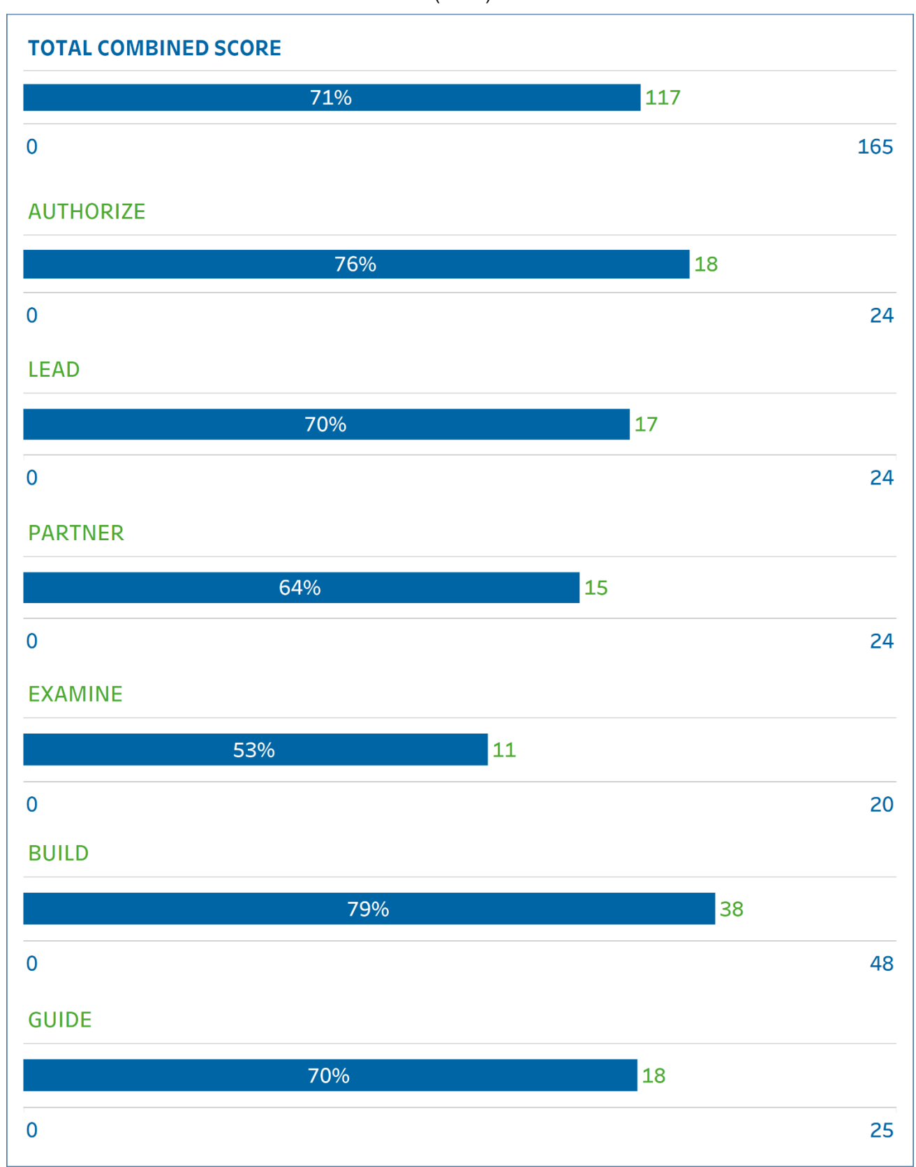
Figure 1: Infrastructure Element and Total Summary Scores and Rates (N=41)