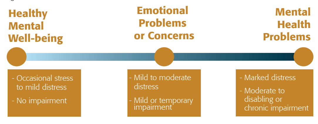
Figure 2 Mental Health Problems Continuum