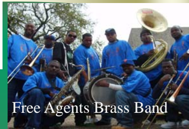
Free Agents Brass Band