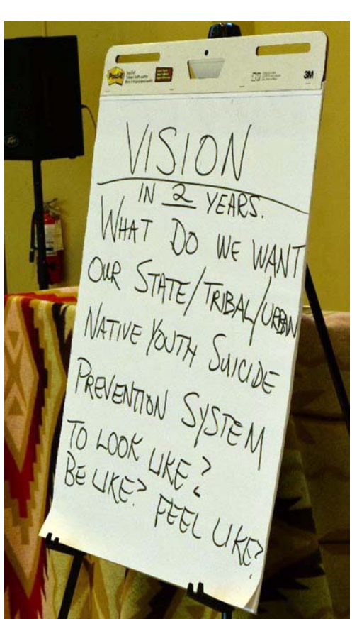
The question posed to those engaged in building the strategic plan.